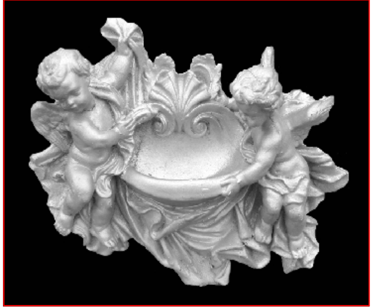
Angels with Bowl