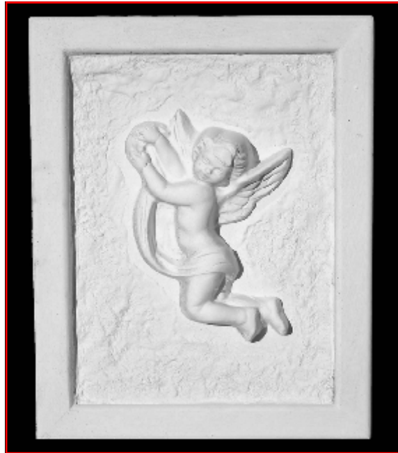
Angel No 3 in Panel 160 mm x 200 mm