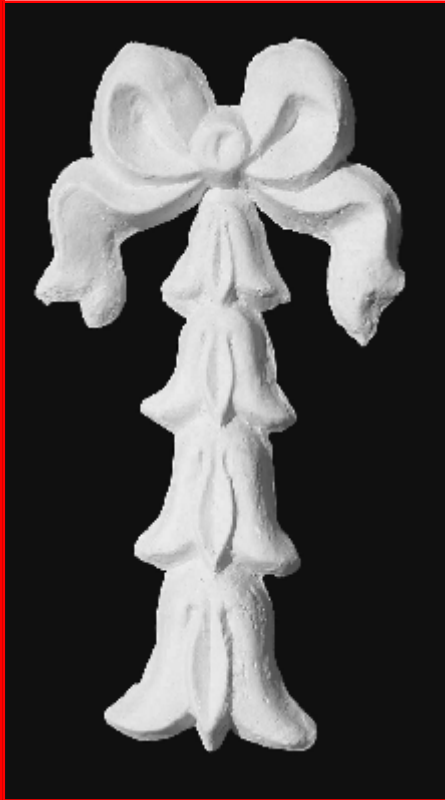
Medium Bowtie 380 mm x 220 mm