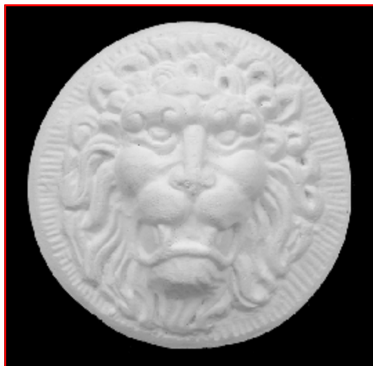
Small Lion Head 50 mm diameter