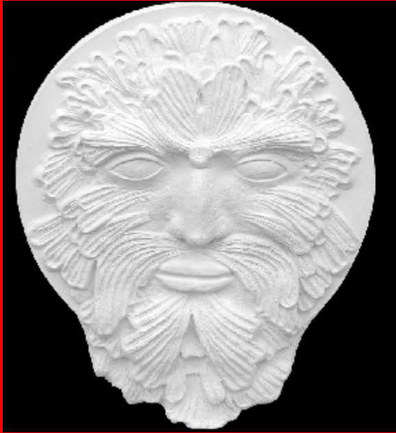
Green Man 275 mm x 340 mm