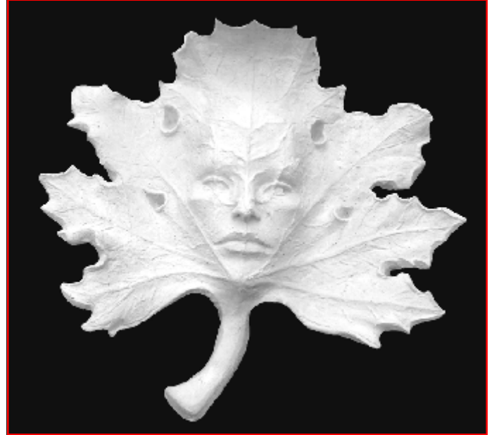
Leaf Maiden 460 mm x 544 mm