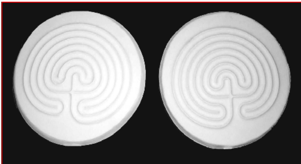
Labyrinths Left and Right 312 mm diameter