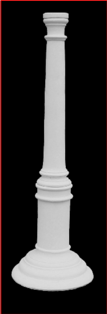
Candlestick Medium 465 mm height