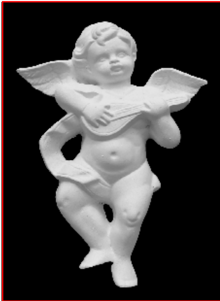
Angel with Violin