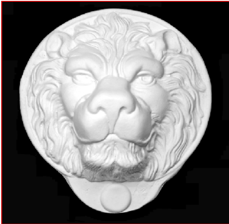
Large Lion Head 185 mm x 165 mm diameter