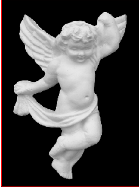
Angel No 1