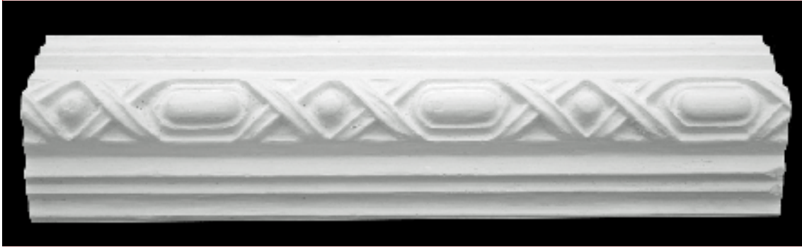
Strap No 6 118 mm x 45 mm