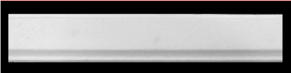
Strap Standard Profile 75 mm