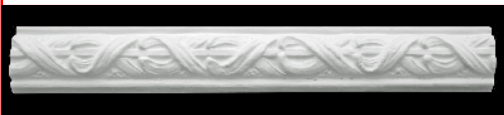
Strap No 5 72 mm