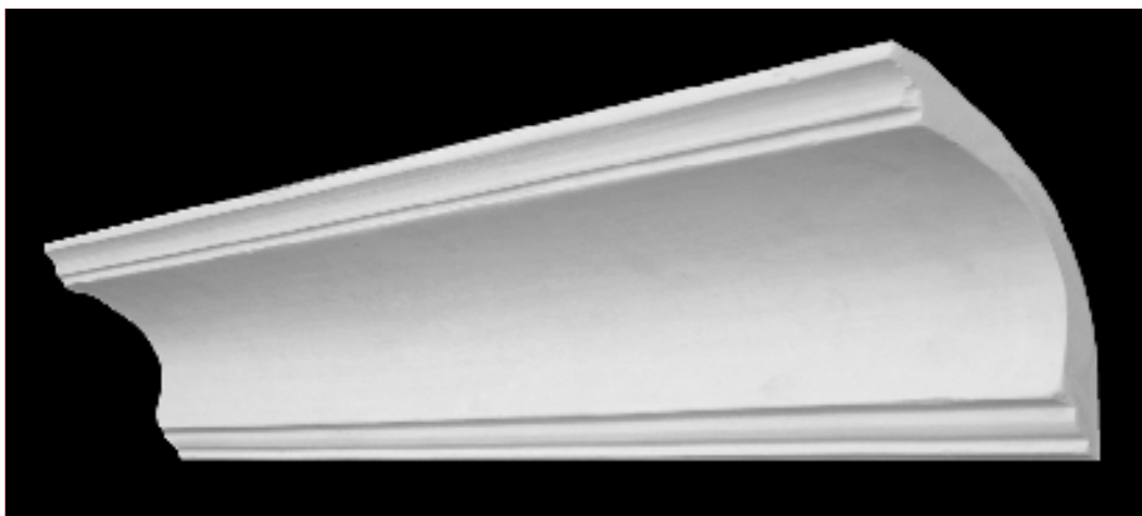
Cove No 2 140 mm x 50 mm