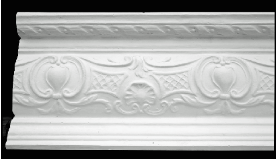
Art Deco Ornate 200 mm x 165 mm