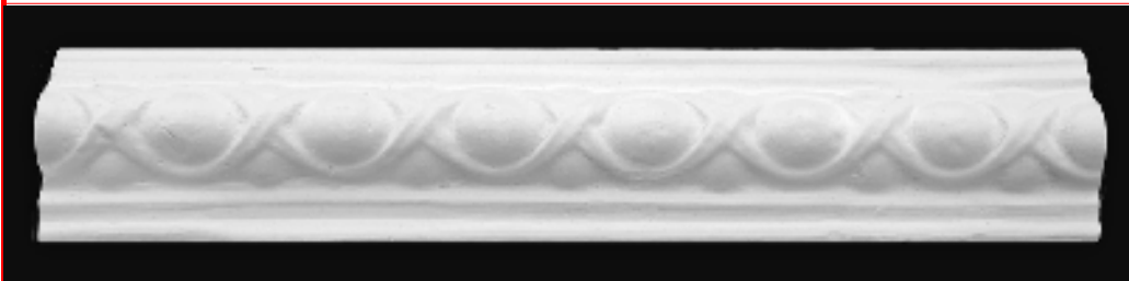
Strap No 2 68 mm