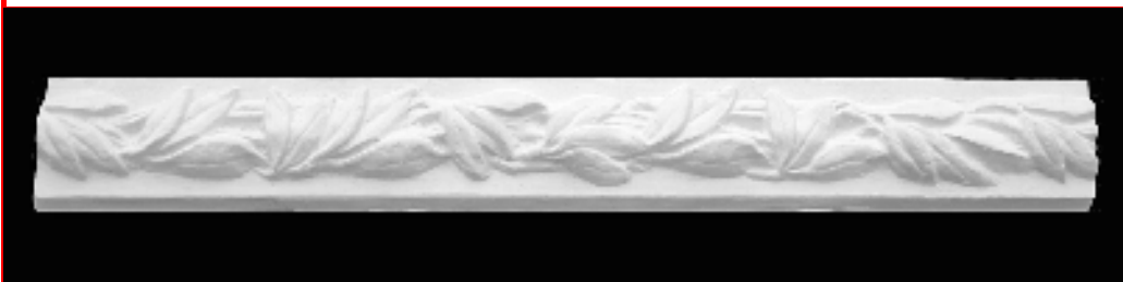
Strap No 3 68 mm