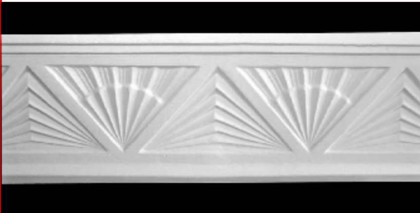
Fan No 1 115 mm x 100 mm

100 mm 135 mm 150 mm 210 mm 280 mm x 3.7 or 4.2 m