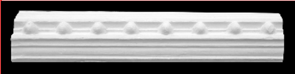
Strap No 1 82 mm