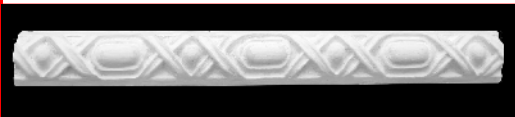
Strap No 4 48 mm