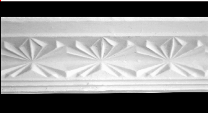
Fan No 2 110 mm x 110 mm